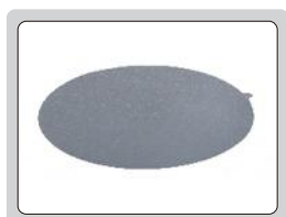
silicon carbide paper(included)